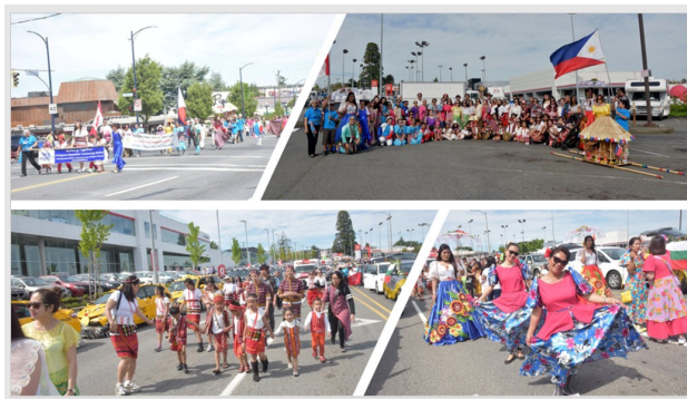
Bayanihan walking group. Victoria Day Parade in 2017

We will gather at 8:00 AM behind Denny's Restaurant along Finlayson Street. Look for the Philippine Flag.