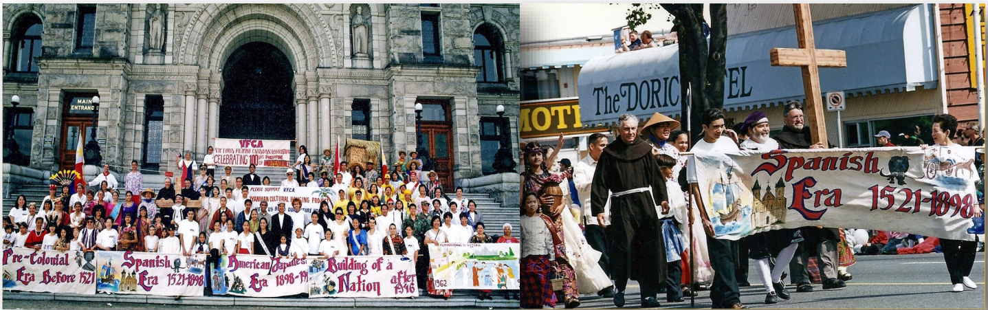
TWENTY YEARS AGO, more than 120 individuals participated in the prize-winning Kalayaan/Freedom '98 tableau celebrating the 100th anniversary of Philippine Independence. The individuals were grouped in appropriate attire according to five eras 1. Pre Spanish; 2. Spanish; 3. U.S. rule/Japanese occupation; 4. Nation building; and, 5. Coming to Victoria. Lets step forward and come in attire to represent historic Filipino personalities at the "Mabuhay! Celebrating Philippine Culture" event.